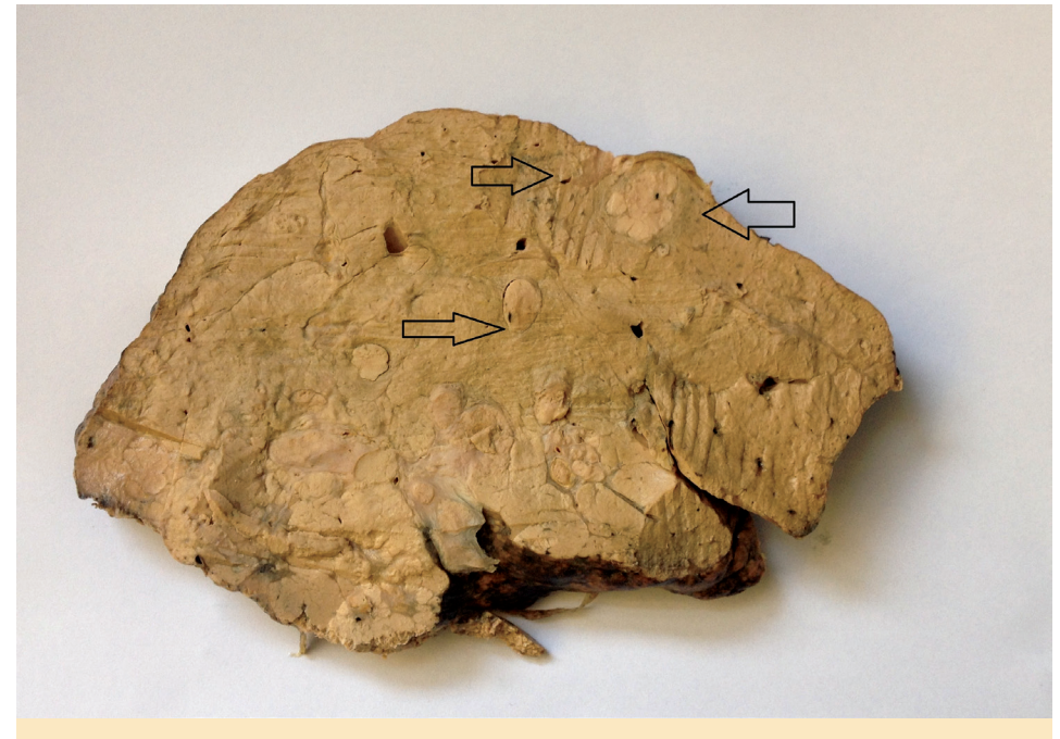
Figure 1: Gross view of the liver shows the three nodules. The upper right nodule and the lower one are HCC; the upper left one is CC.

liver transplantation waiting list during which period, he experienced several episodes of decreased level of consciousness.