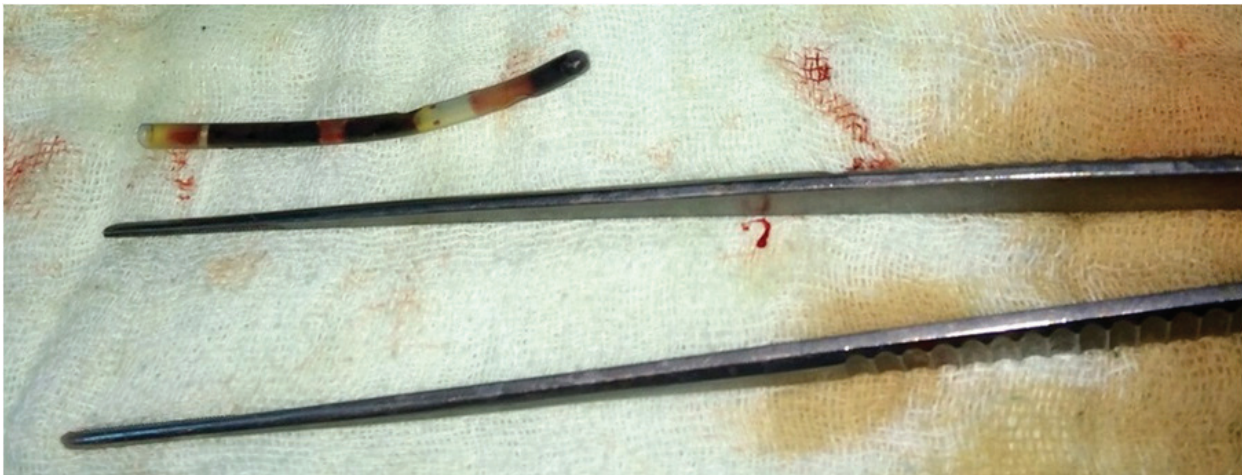
Figure 2: The foreign body removed from the anterior branch of the right portal vein.

Liver transplantation is a multi-staged complex operation including donor hepatectomy, back-table procedure, recipient hepatectomy and implantation. This operation takes more time compared to other surgical operations; many medical staffs participate in the proce-